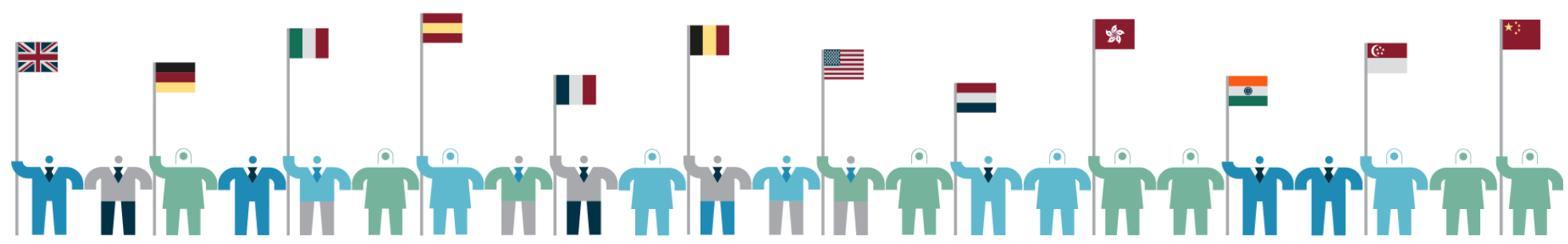
*Services in India are provided by a relationship firm